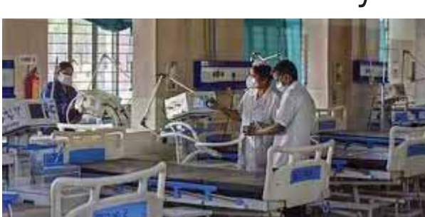
NEW DEI HI

ovid-19 sub-variant JN.1 Chas made its presence felt in at least 12 States from January 7 till date on Monday as the incidents rose to 682, official sources said on Monday. They said 199 cases have been reported from Karnataka, 148 from Kerala, 139 from Maharashtra, 47 from Goa, 36 from Gujarat, 30 from Andhra Pradesh, 30 from Rajasthan, 26 from Tamil Nadu, 21 from Delhi, three from Odisha, two from Telangana and one from Haryana. Even though the number of cases is rising and the JN.1 sub-variant has been detected in the country, there is no cause of immediate concern as the majority of those infected are opting for homebased treatment, indicating mild illness, officials said.