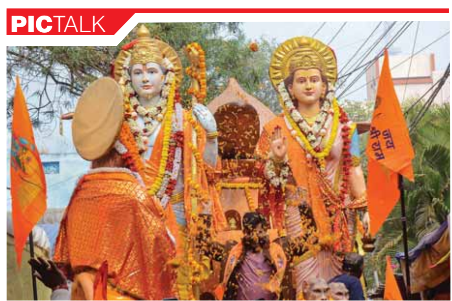
Devotees participate in a 'Ram Rath Yatra' ahead of the consecration ceremony of Ayodhya Ram temple, in Ranchi

Opposition to ensure checks and balances. The absence of a formidable Opposition can potentially impact the democratic fabric of Bangladesh, leading to concerns about the concentration of power in the hands of one political party. Hasina's supporters argue that her leadership has been pivotal in driving economic growth and social progress, justifying the measures taken to secure her victory. International observers and human rights organisations have, however, raised concerns about the fairness of the electoral proceedings. The Government's control over key institutions and the media has also been criticised for limiting the space for dissent. Back home, the victory of Hasina is good news as she is a known supporter of India and enjoys good rapport with the Indian Prime Minister. Bangladesh holds strategic importance for India due to shared historical, cultural and economic ties. The bilateral relationship has seen positive developments in recent years in areas such as trade, security and connectivity. Hasina's continued leadership is likely to maintain stability and foster cooperative endeavours between India and Bangladesh. For its part, India must convince her to allow space to the Opposition and let the democratic institutions run independently. It would be good for her and Bangladesh in the long run.