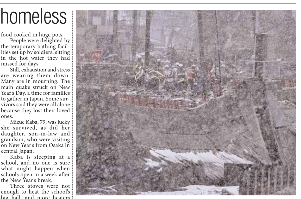
Firefighters search for missing people in the snow in Wajima, Ishikawa prefecture, Sunday. Rescue teams worked through snow to deliver supplies to isolated hamlets Monday, a week after a powerful earthquake hit western Japan.